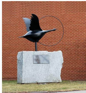
A statue of the Black Goose near town hall. The Black Goose was a key component of the Baldoon Mystery.

For more details go to: mysteriofcanada.com