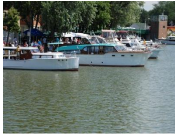
Boats docked behind the library during WAMBO.