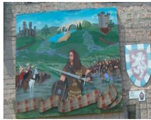
A mural of William Wallace, our town's namesake, on Wallaceburg's south side.