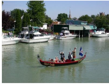
The Black Goose Gondola

Three scrambled eggs grilled with any THREE of our omelet fillers and served in a tortilla wrap.